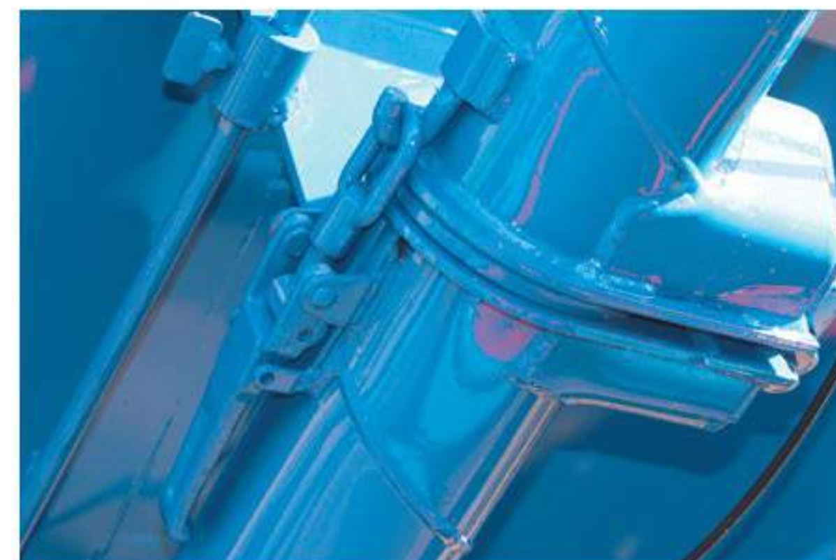
HEAVY DUTY AUGER LOCK