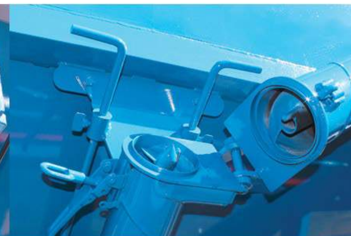
INDIVIDUAL HOPPER DOORS