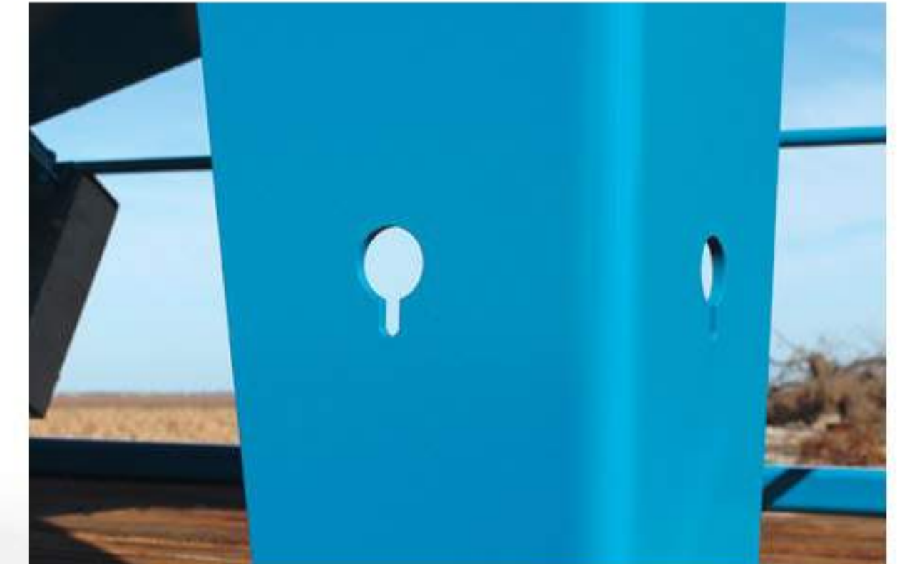
BUILT IN TIE-DOWN POINTS