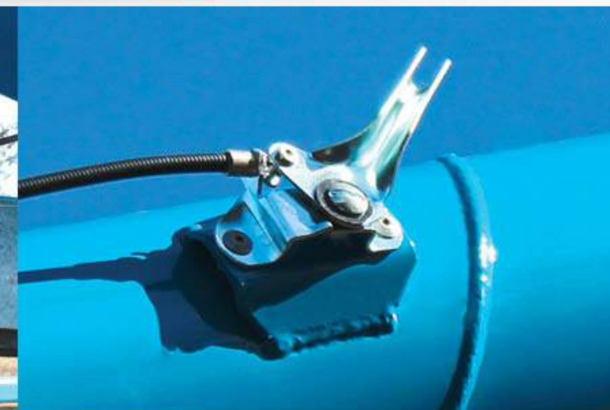
HEAD MOUNTED THROTTLE