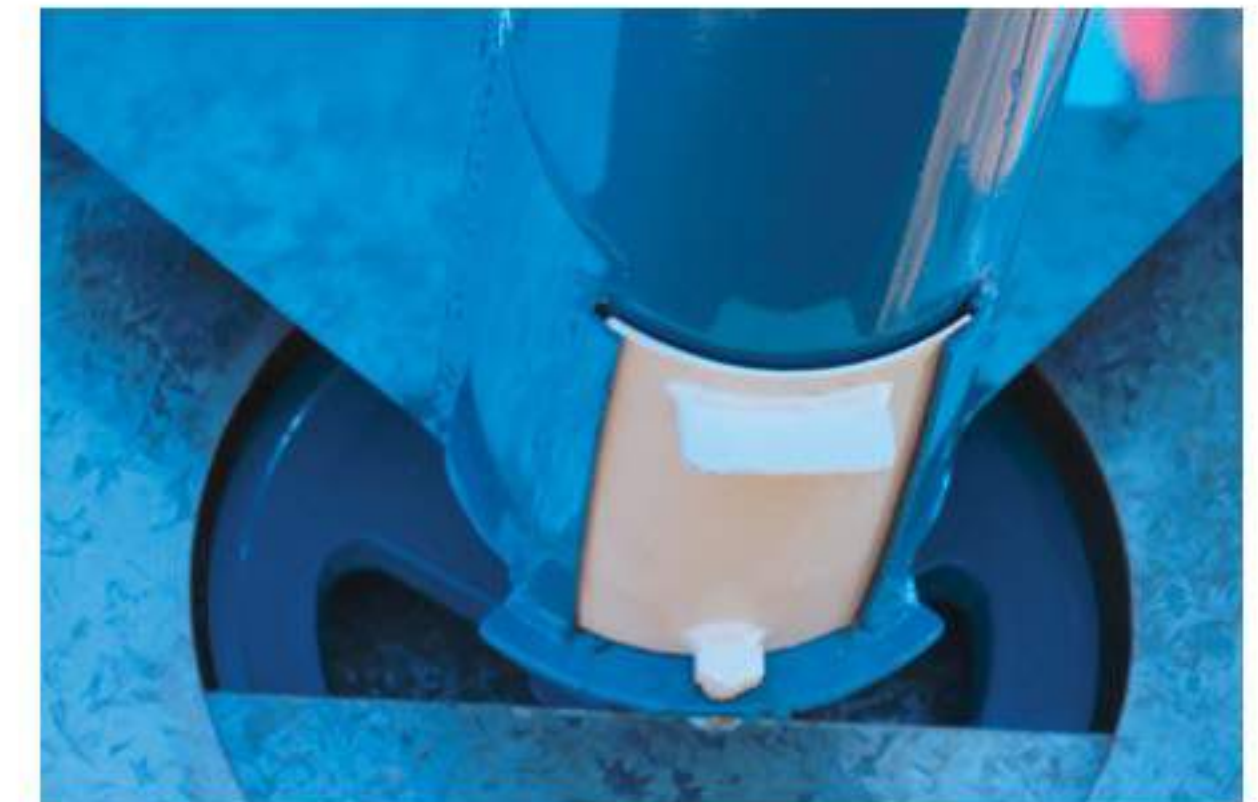
AUGER CLEANOUT DOOR