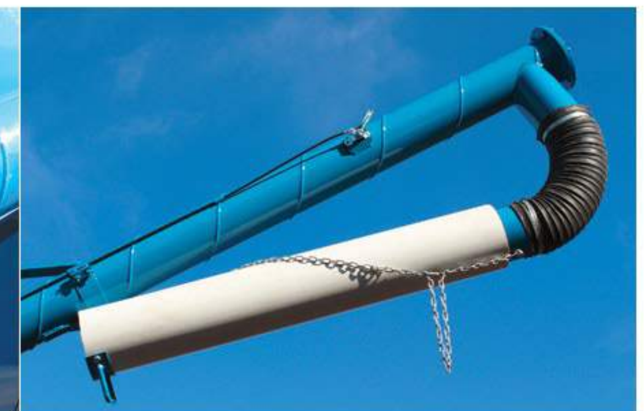
FLEXIBLE TELESCOPIC SPOUT