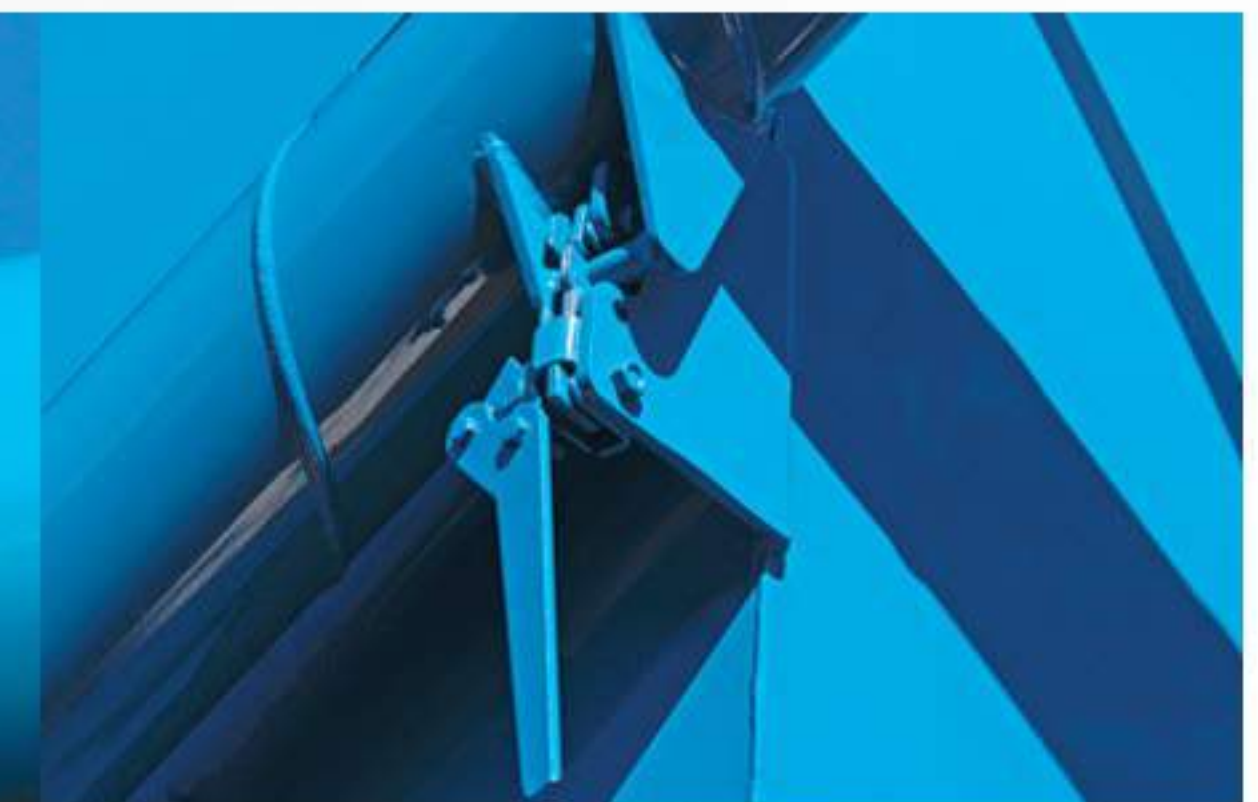
SLAM LATCH LOCK