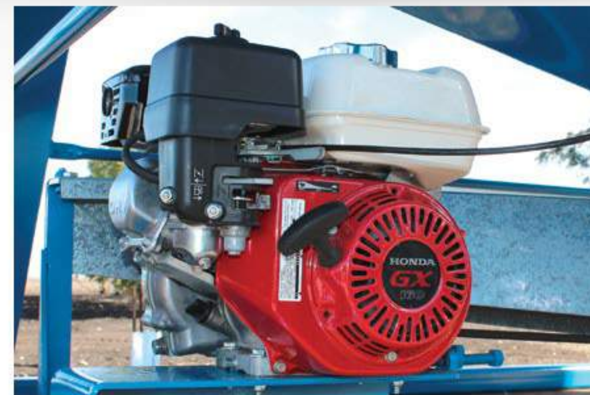
HONDA GX160 ENGINE